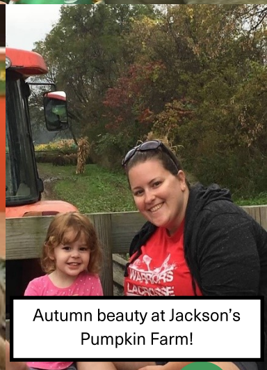
Autumn beauty at Jackson’s Pumpkin Farm!