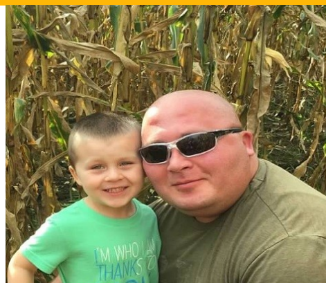
Pumpkin Farm Fun!