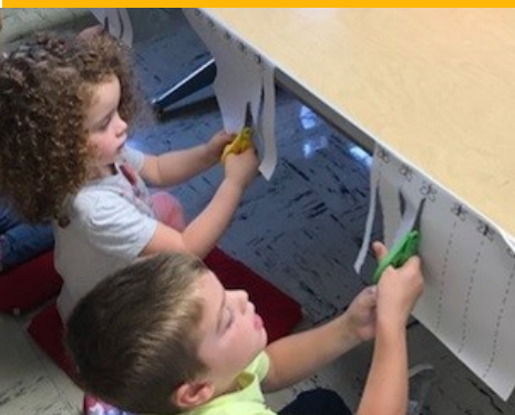
Vertical Surfaces= Stronger Muscle Control!

Staff from Northminster Preschool and the Maine-Endwell UPK team were able to join our First Pres. family on October 5. It was an enriching and educational day for us all!